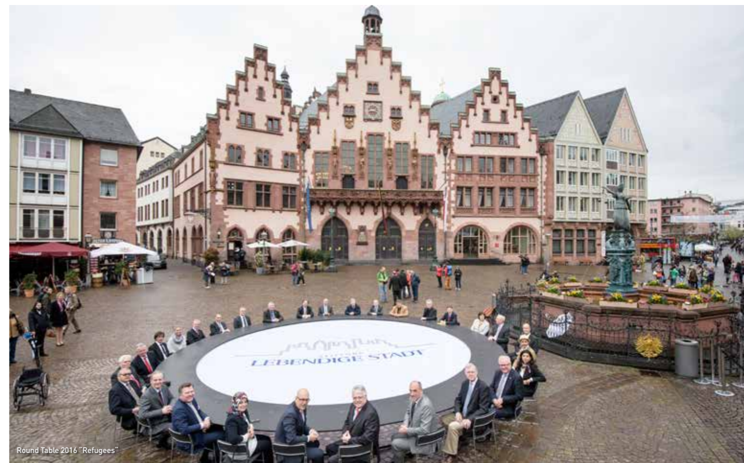
Round Table 2016 "Refugees"