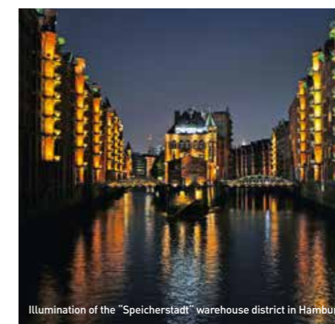
Illumination of the "Speicherstadt" warehouse district in Hamburg