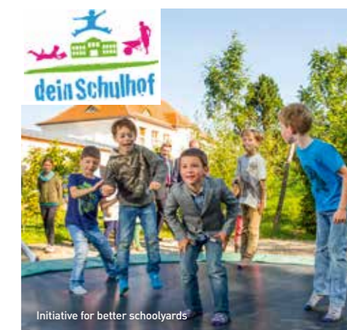
Initiative for better schoolyards