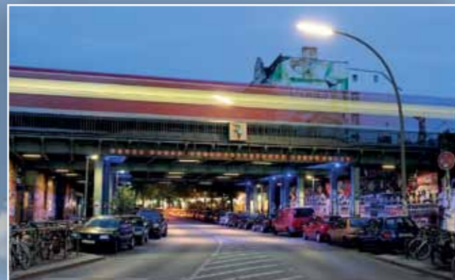
Illumination of Altona's Sternschanze bridge