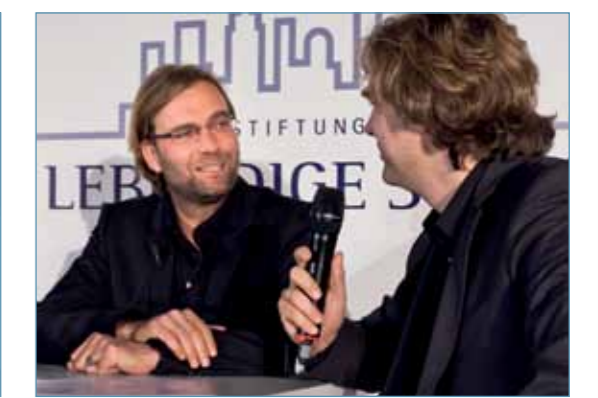
Jürgen Klopp and Michael Steinbrecher (from left)