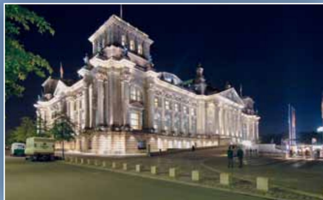
Illumination Berlin Reichstag building